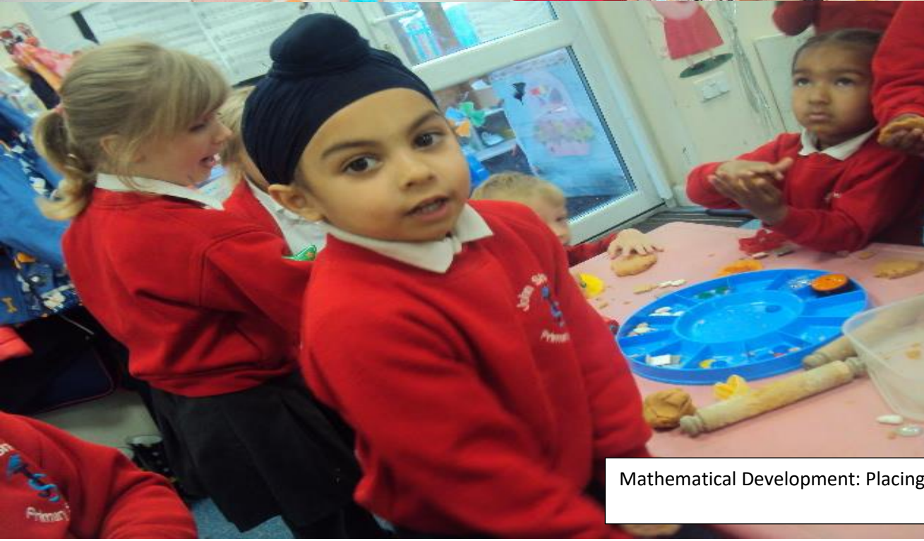
Mathematical Development: Placing and Arranging