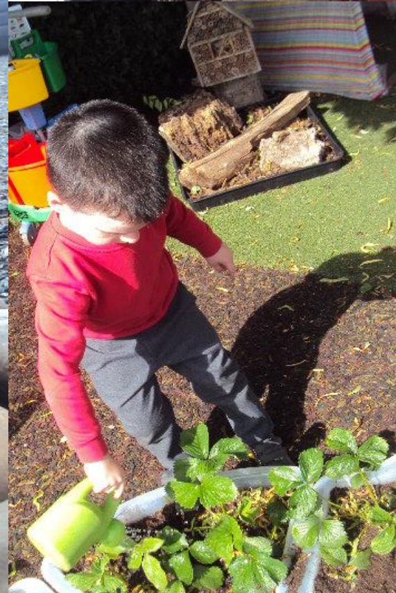
Outdoor Learning: Understanding of the World, Physical Development