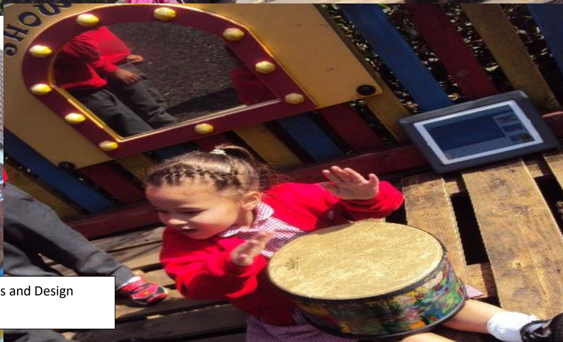
Expressive Arts and Design