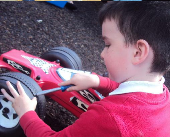
Communication and Language, Personal Social and Emotional Development