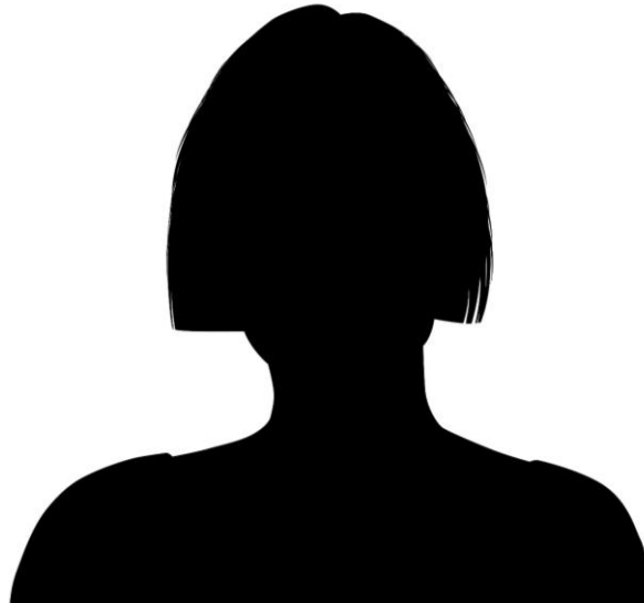
SEND Teaching Assistant