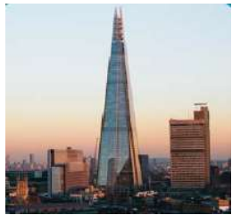
The Shard, London (Renzo Piano)