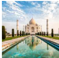
Taj Mahal, India (Ustad Ahmad Lahori)