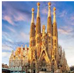
La Sagrada Familia, Barcelona (Antoni Gaudi)