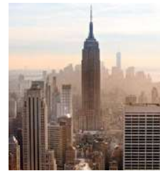
Empire State building, New York City (Shreve, Lamb & Harmon)