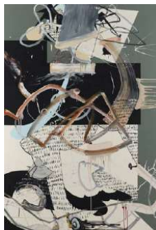
Untitled, 1991 (oil on canvas) by Fiona Rae.