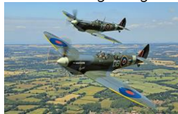
Britain and the Blitz